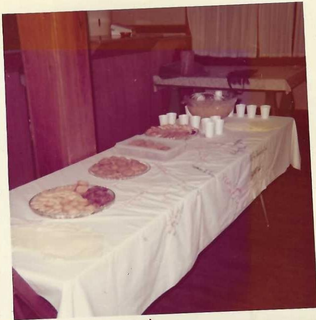
Table set for Quik Party