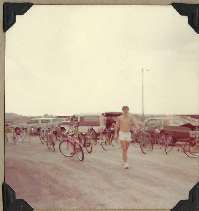
Bike Ride Wheels