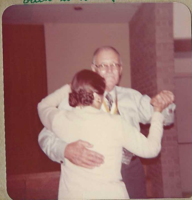
Grand-Dad and Mrs.