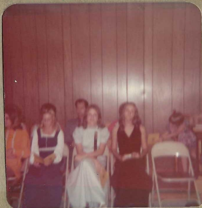
Friends of De Molay