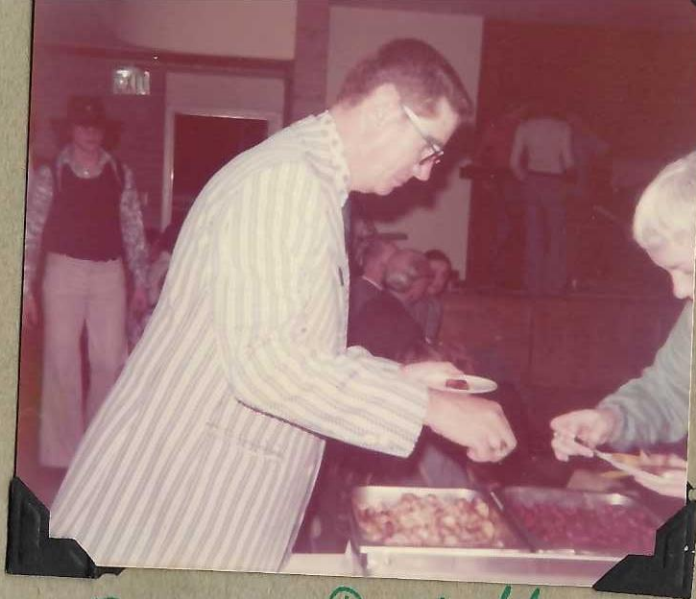
Mom + Dad Sharp