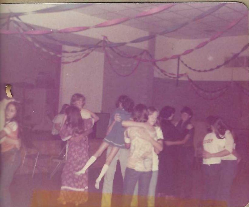
DeMolays + Rainbows - Halloween 1976