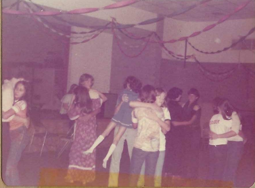
DeMalays + Rainbows - Halloween 1976